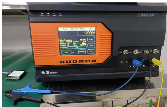
3.2 群脉冲测试图 EFT test